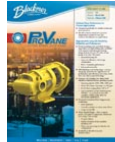
ProVane® Spec Sheet (PDF)