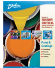
Paint & Coatings Solutions Brochure (PDF)

If you have any questions or would like additional information, please feel free to reply to this email.